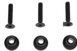
QL3.1 studs (incl.)