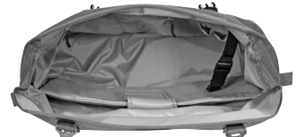
Inside: padded laptop sleeve