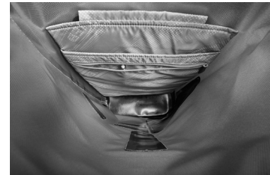
Notebook sleeve for laptops