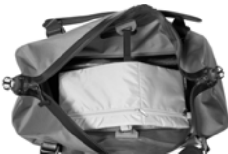
New, removable inner pocket protects contents from getting caught in the zipper