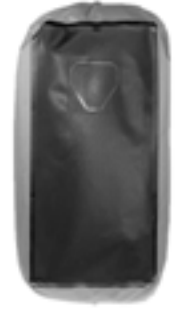
Reflector symbol on the bottom of the bag