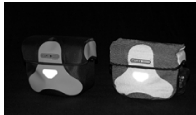
Comparison: Ultimate Classic (left), Ultimate High-Vis (right)