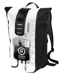
Design „Riders Resilience“