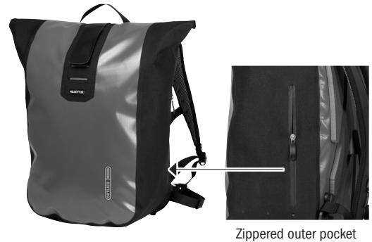
Zippered outer pocket